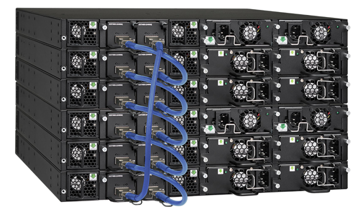
Figure 1: Ruckus ICX switches can be stacked together using standard SFP+ or QSFP+ ports and optics to create a single logical device over distances up to 10 km.