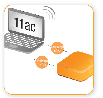
Blinding Fast 3-Stream 802.11ac