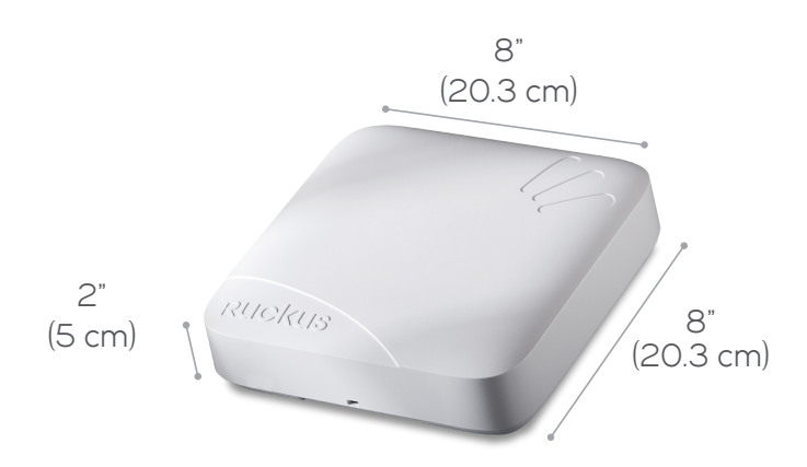
weight is 1 kg. (2.25 lbs.)